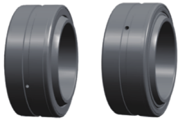
滑动摩擦副：钢 / 钢 Sliding contact surfaces: Steel / Steel