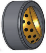
滑动摩擦副: 钢 / 铜合金 Sliding contact surfaces: Steel / Copper alloy