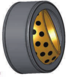
滑动摩擦副: 钢 / 铜合金 Sliding contact surfaces: Steel / Copper alloy