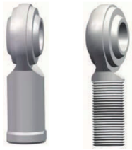
滑动摩擦副: 钢 / 钢